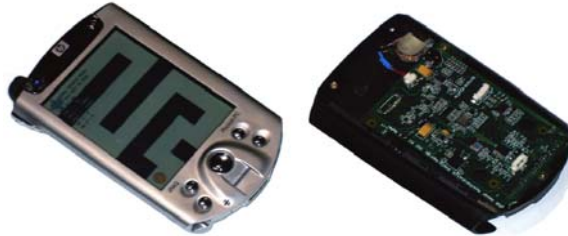
Fig. 2. MESH hardware. Shown next to an IPAQ running a simple tilt-driven maze game

temporal resolution to capture data to drive gesture recognition algorithms. For the work described in this paper, the data is gathered from the sensors at 100Hz, and transmitted over an RS232 serial link to the IPAQ.