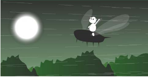
Figure 2. scene from haptically enhanced cartoon.

To explore this idea, we have created a number of cartoons that feature presentation interaction. The first example we produced was a short sequence embedded within a much longer narrative detailing the adventures of a nocturnal elf. As the cartoon begins, the protagonist is riding a bee through a forest. This scene is represented visually as shown in Figure 2, sonically by a buzzing sound coupled with the elf's sporadic and gleeful laughter, and haptically (on a small 2 DOF force feedback display) by a high frequency vibration additively combined with a force vector derived from the character's displacement from the centre of the screen. Viewers are able to interact with the presentation of this scene by manipulating the haptic actuator, which also serves as a position sensor. By moving the actuator, the character's rendered location is changed. This involves the alteration of the force vector in the haptic presentation, the spatialisation of the audio cues, and the character's visually displayed position. However, regardless of whether the viewer chooses to interact with the scene, it always ends in the same manner and at a predetermined time: the elf falls from the bee, and the narrative moves on to the next scene.