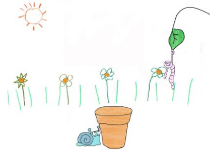
Figure 3. Scene from haptically enhanced cartoon.

In another example, illustrated in Figure 3, two characters are on screen simultaneously. On the right of the screen, one is dangling precariously from a leaf, while on the left the other is hurrying to reposition a bucket in order to provide a safe landing place for the first's inevitable fall. In this instance, a viewer can aid the second character as they push the bucket, by moving the haptic actuator against a force representing the bucket's resistance to motion, its friction against the ground. Doing so influences the visual and audio presentation of the scene by having the character and bucket move more rapidly across the screen. The haptic presentation is altered as the friction can only be perceived by actively pushing against it. Once again, whether or not the viewer chooses to interact with the scene the final outcome remains the same: the first character is saved by the timely actions of the second.