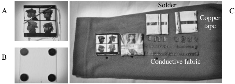
Fig. 2. Patch sensor A) front of final tag B) inner structure of tag showing rare-earth magnets at each corner C) jacket sleeve with conductive fabric; two tags are attached and two tags show circuitry on the back of the tags

observable position. The physical state of the device mirrors the state of the sensed digital data. They can also both be integrated into the functional fastenings of an item of clothing to measure aspects of the garment state – for instance whether or not a jacket or pocket is open or closed. Alternatively, they can be sewn into a non-functional zone to serve as a control device capable of manipulating a variable such as the volume in wearable media player (continuous input with the zipper) or the ring tone profile selected on a mobile phone (discrete input with the cord and bead). We believe these devices provide general-purpose functionality for wearable applications.